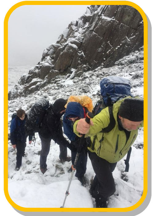
Oak Eagle Scout Unit Winter Walking Weekend January 2018

Editor: Rita Hawkins 1 South Close Baldock Hertfordshire SG7 6DS