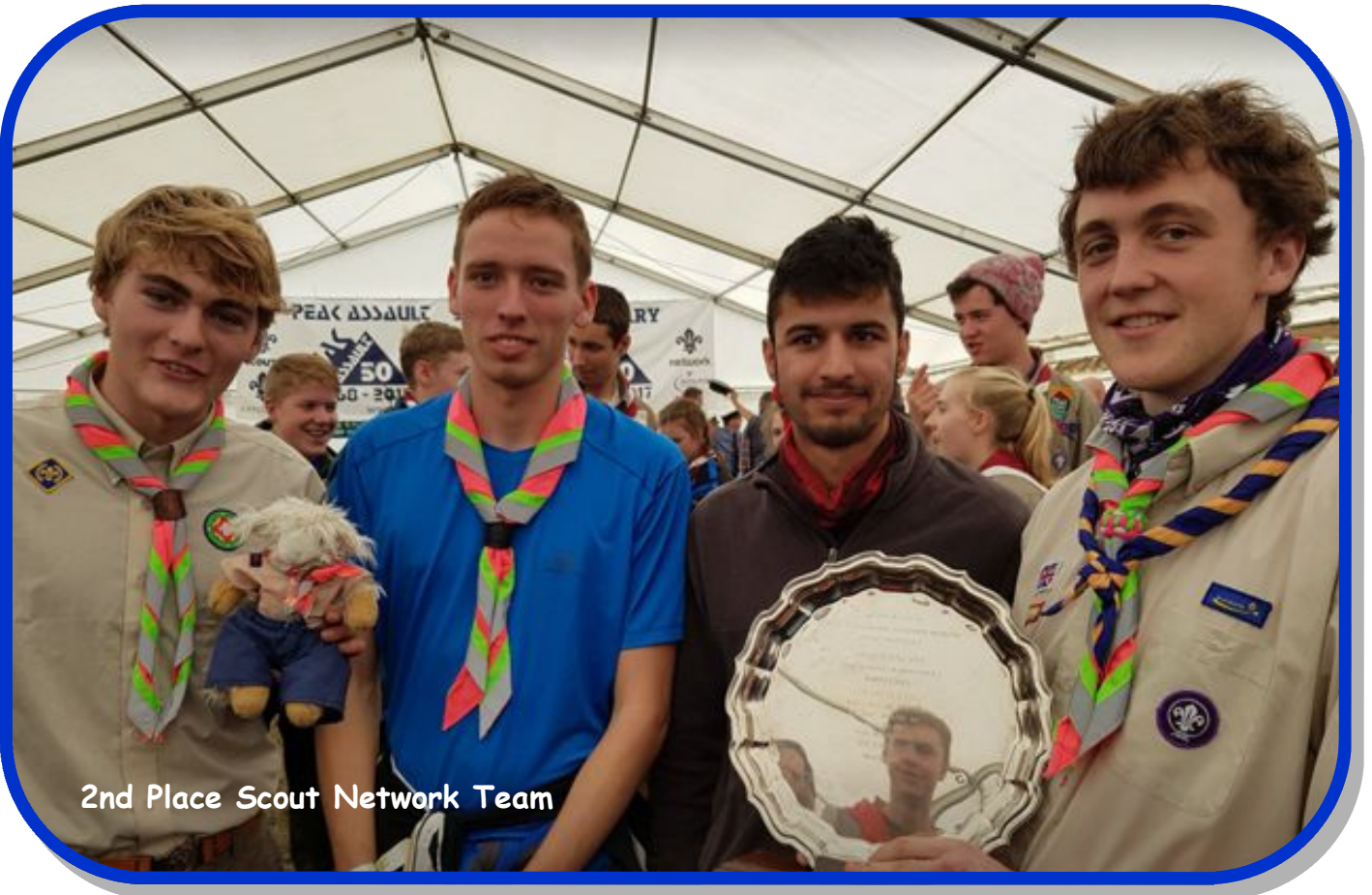
2nd Place Scout Network Team

There are three competition classes, Explorer (14 – 18), Network (18 – 25) and Senior (25+).