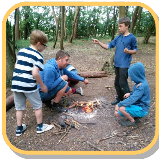
2nd Baldock Scout and Cubs camping weekend in June at the Leslie Sell Activity Centre,