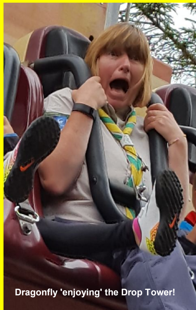
Dragonfly 'enjoying' the Drop Tower!