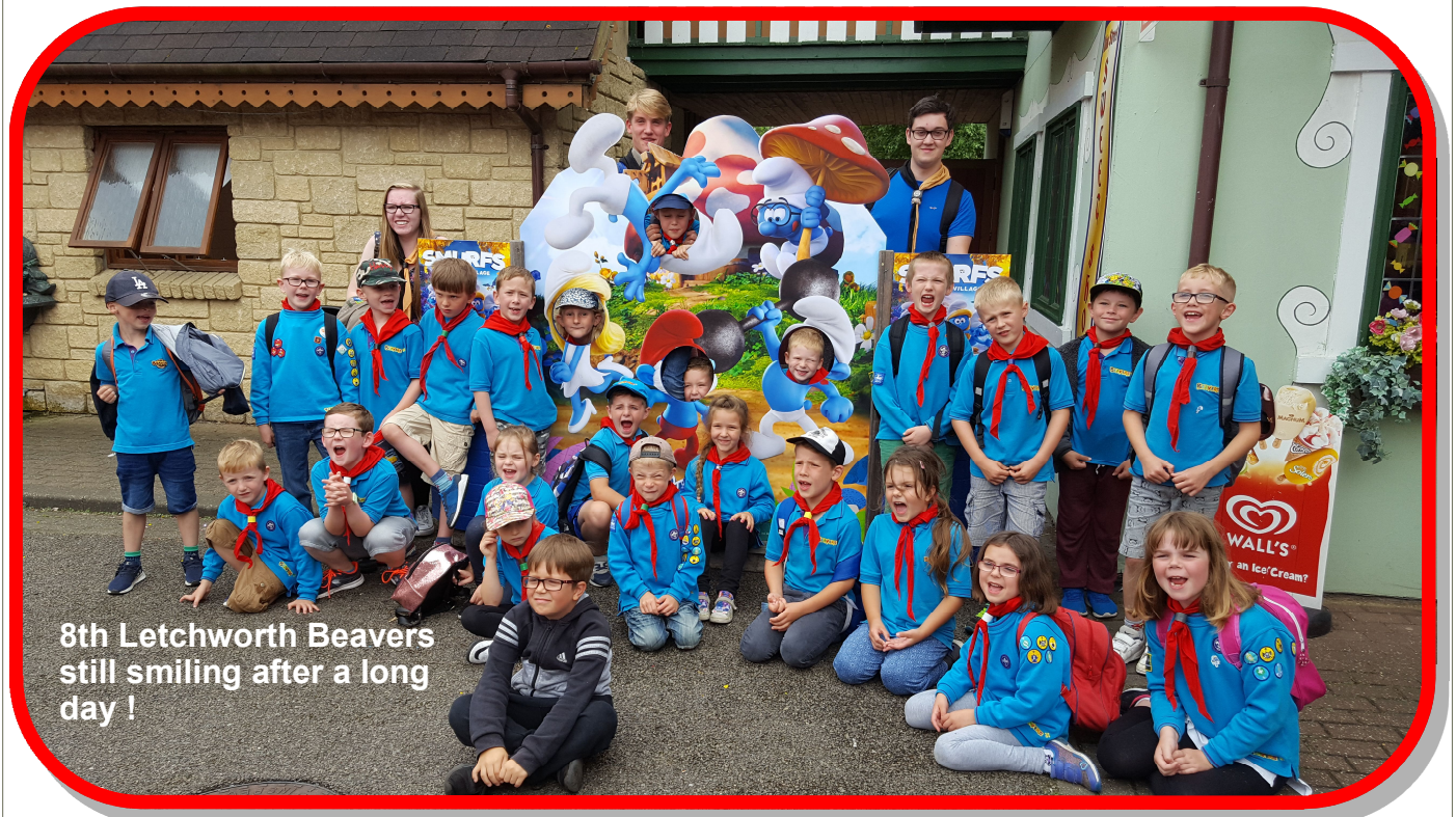
8th Letchworth Beavers still smiling after a long day !