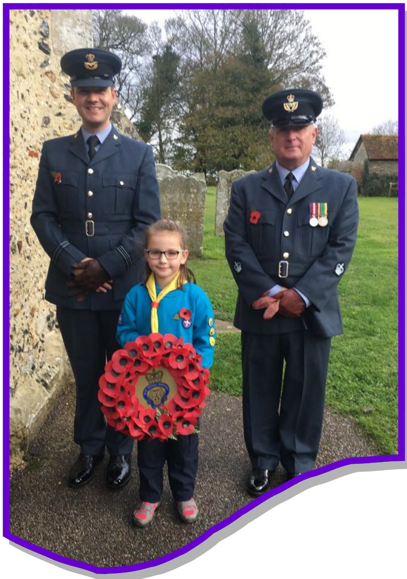
War Memorial Letchworth