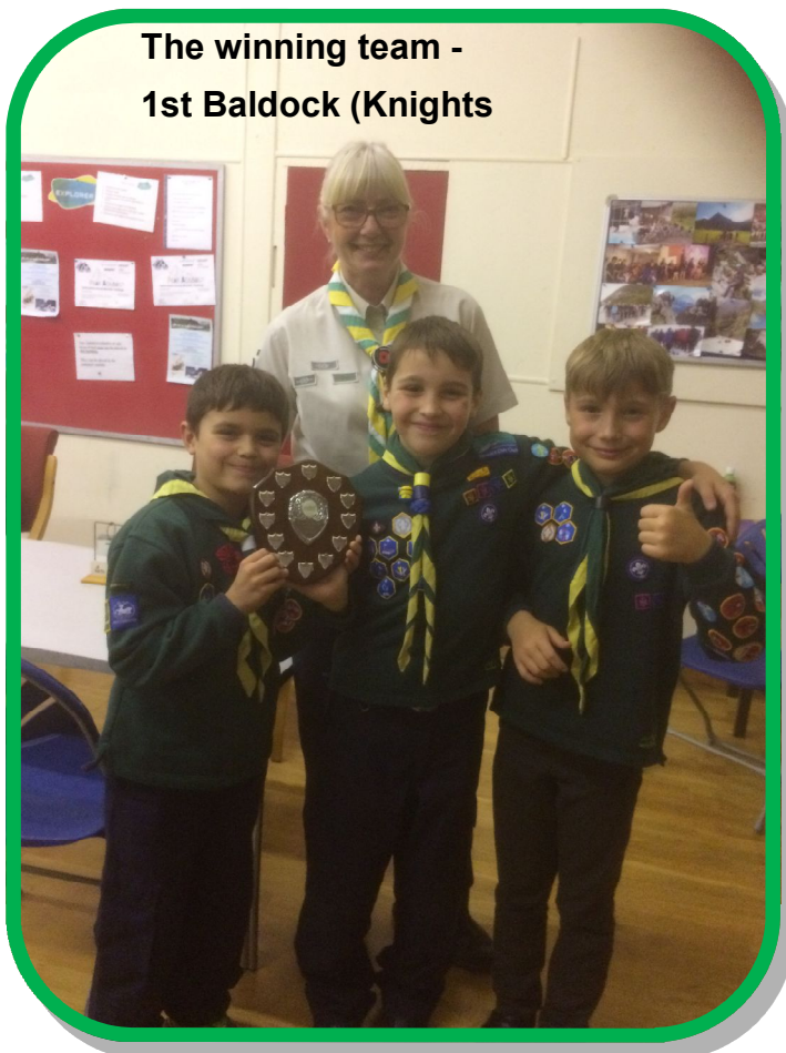
The winning team - 1st Baldock (Knights)