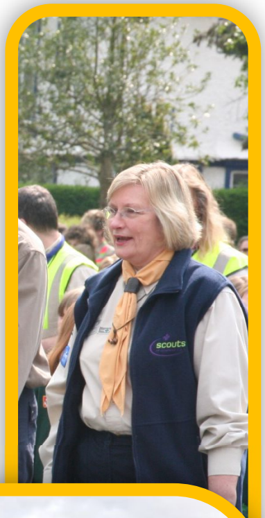
Top Right: 2011 St Georges Day Parade

As we move on to a world which will still have corona virus circulating for some time, I'm sure that the online meetings will now be part of our everyday life but being together in the great outdoors will be more important than ever. 40 years on some things don't change!