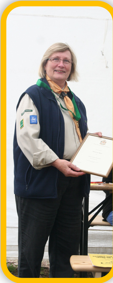
Left: 2012 AGM Harmer Green