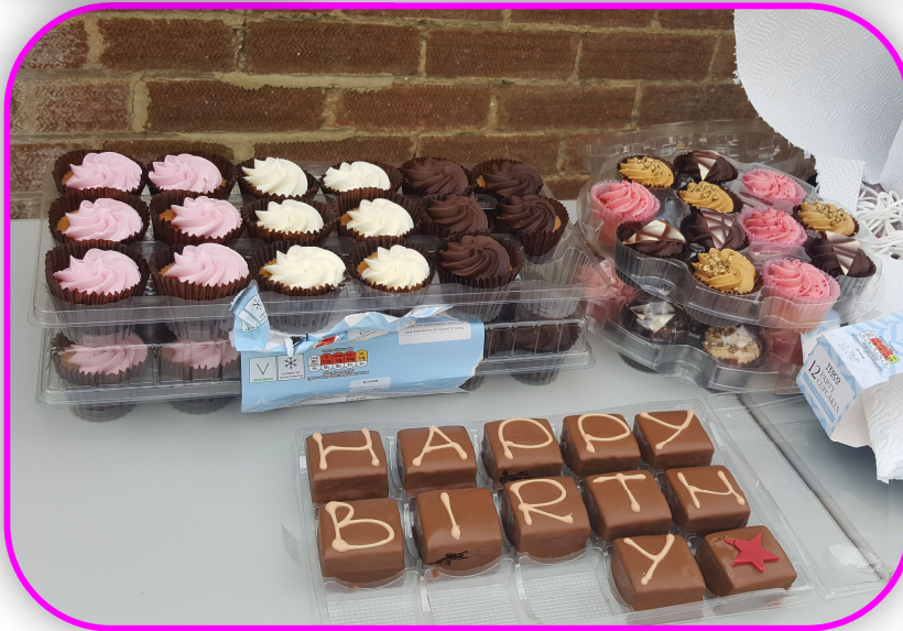
5th Letchworth contribution to the 75th anniversary cupcake