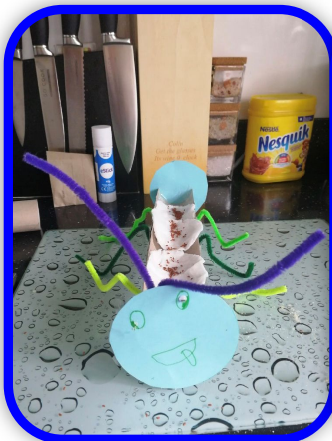
Caterpillar waiting to grow cress Samuel Mott

7th Cubs have been making Cress Caterpillars (Cressipillars). We built a caterpillar from half a toilet roll, card and pipe cleaners. Cubs decorated these and added googly eyes. Cubs have been looking after them and watching them grow for their science badge.