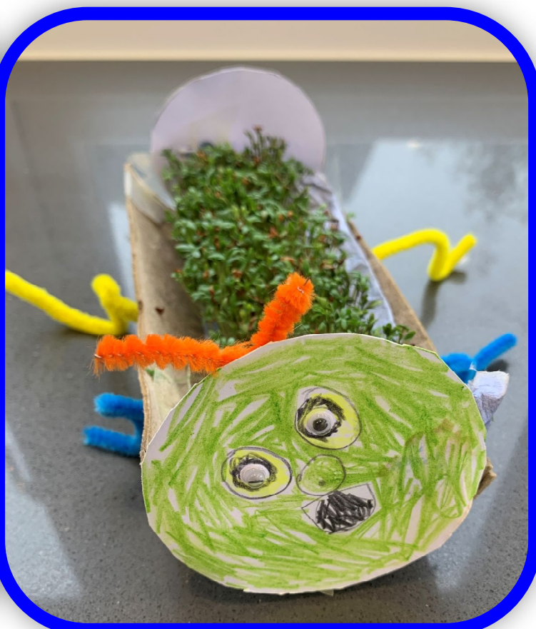
Cress growing - George Dolman