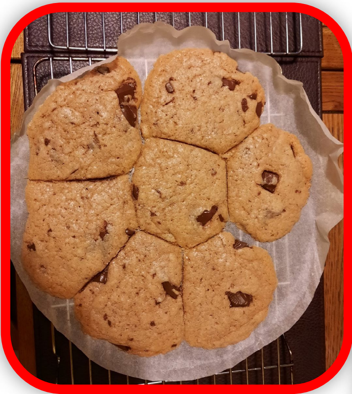
Photos from Flavio Vieira, Ben Powles and Daisy Collen. - 8th Letchworth Cubs