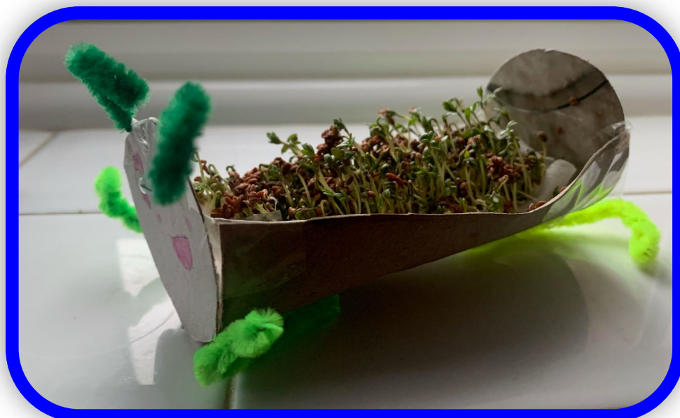
Alivia Newman - sprouting caterpillar