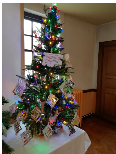
8th Letchworth Cubs at the Hospice Christmas Tree Festival.