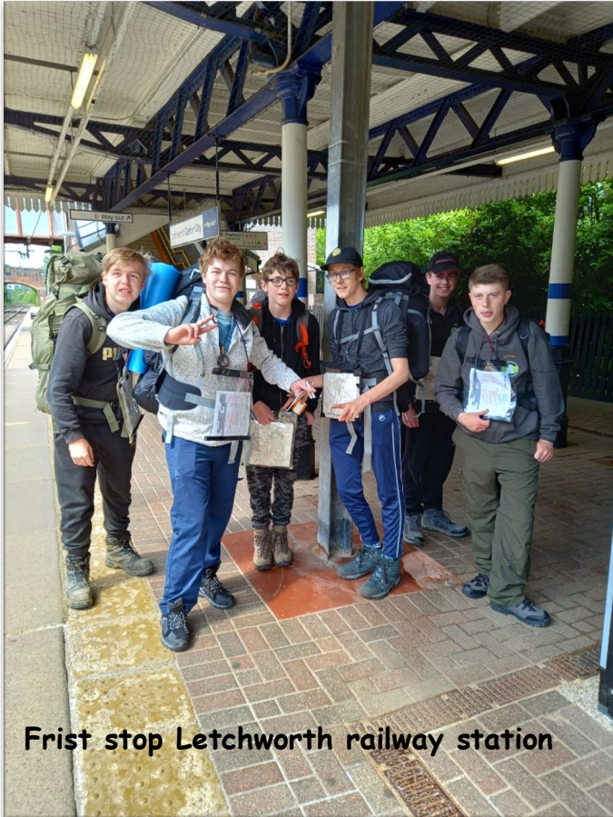
Frist stop Letchworth railway station