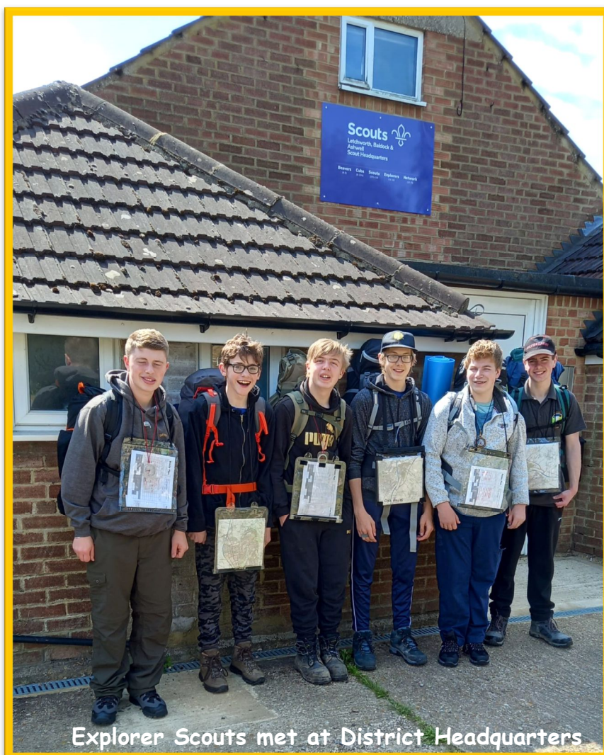
Explorer Scouts met at District Headquarters