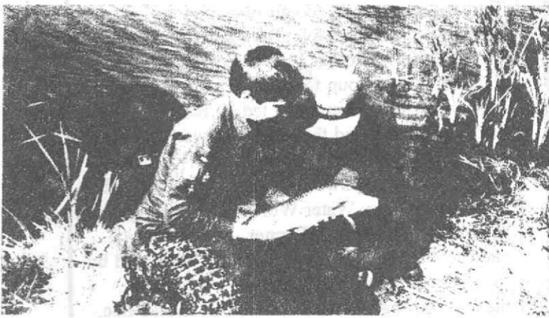
CATCH OF THE DAY 7LB CARP