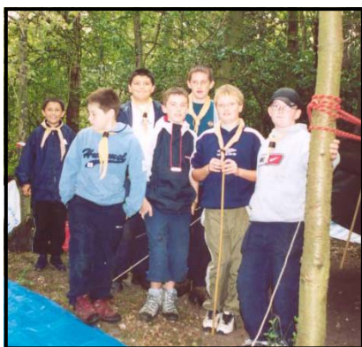
2nd Baldock Scouts

12th Letchworth were entered as a training/novice team and they did very well considering they were so young.