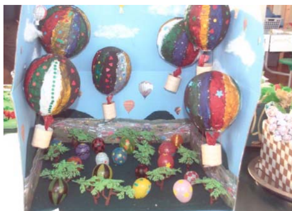
5th Letchworth Beaver Colony entry

Thank you to the Beaver Section for organising this year's competition. Thanks also to the Scout Fellowship for providing the judges. The Cub section will be organising the 2007 competition.