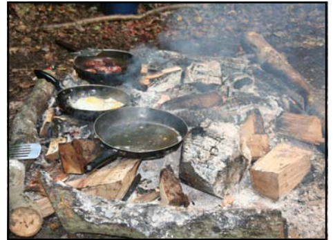
Breakfast at 8th Letchworth Camp - Harmer Green

wine the Fellowship members present were presented with their Centenary Neckerchiefs.