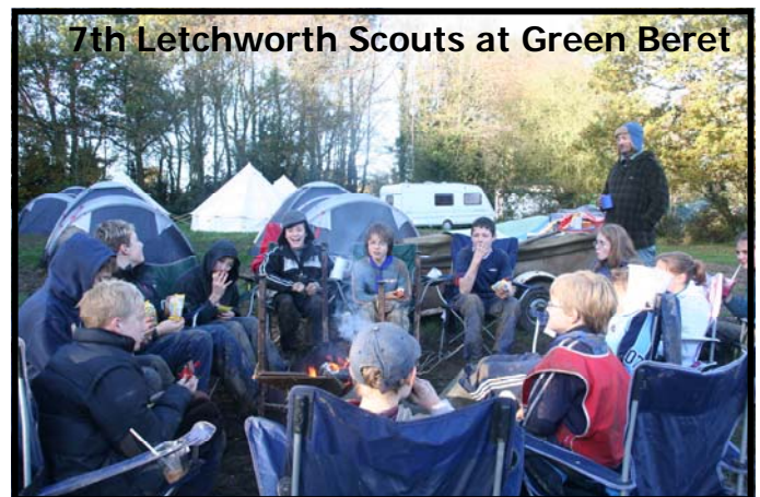
7th Letchworth Scouts at Green Beret