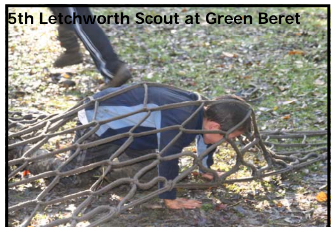
5th Letchworth Scout at Green Beret