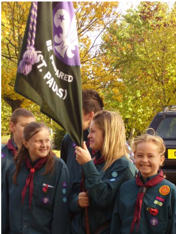
4th Letchworth Scout - Remembrance Sunday