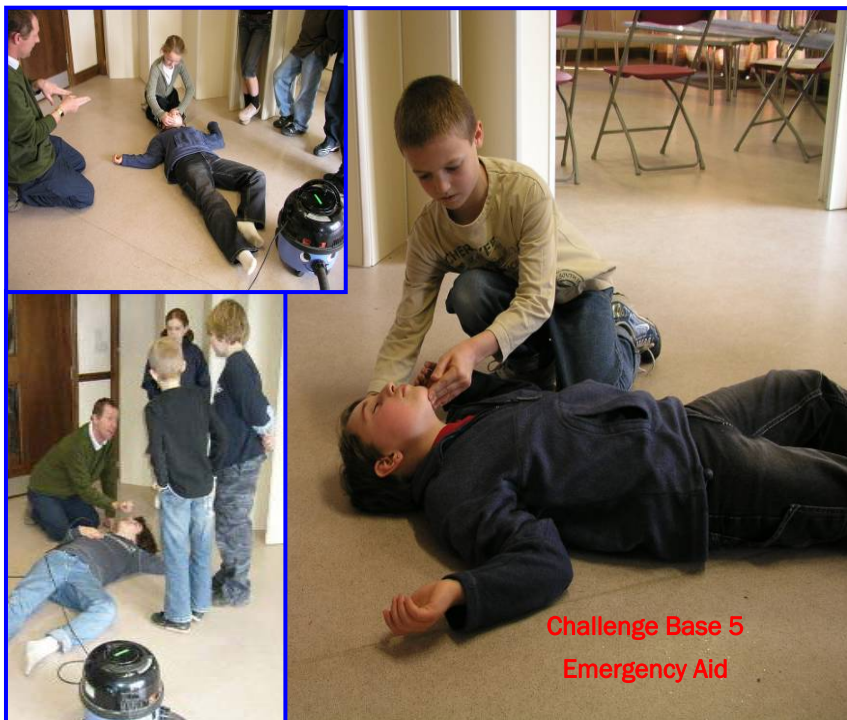
Challenge Base 5 Emergency Aid

Well done to all concerned for being prepared to muck in together to ensure such a successful camp.