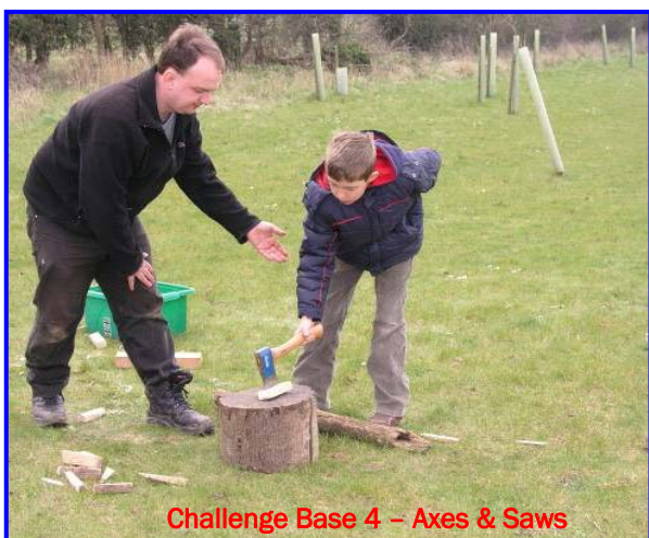
Challenge Base 4 – Axes & Saws

Being prepared had another major role to play in the weekend's activities. This year I volunteered to organise and run the camp and, like all Camp Leaders, in the weeks leading up to it I made sure that everything was organised and that everyone knew what they were doing. As it turned out my preparations proved to be very worth while as, because of illness, I couldn't be there to run the camp.