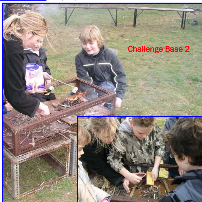
Challenge Base 2

The first challenge was linked to the Centenary Year and involved collecting 100 points worth of items and information from around the campsite. From finding out how many bolts are in the assault course (89 if you're interested!) to finding a feather or a dock leaf. The Cubs were kept busy whilst the whole arrival and registration process was completed.