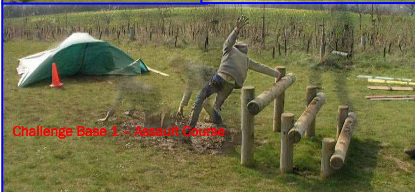
Challenge Base 1 – Assault Course