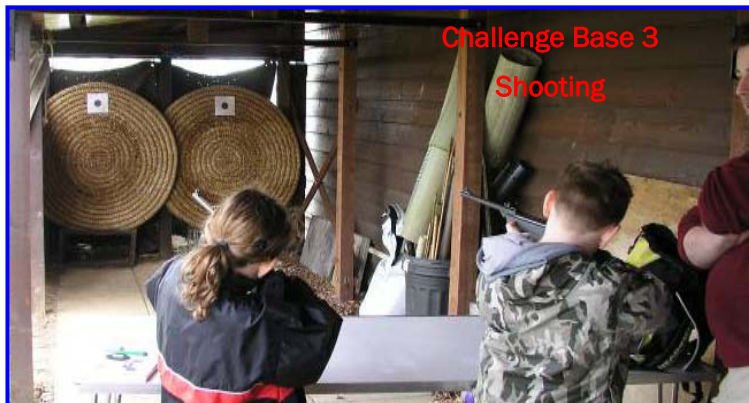
Challenge Base 3 Shooting

Every one of the Cubs completed their mission with flying colours; new skills were learned, new badges were achieved and everyone had a great time. The only casualties were some very dirty clothes and some very tired Cubs (and some exhausted leaders too!!).