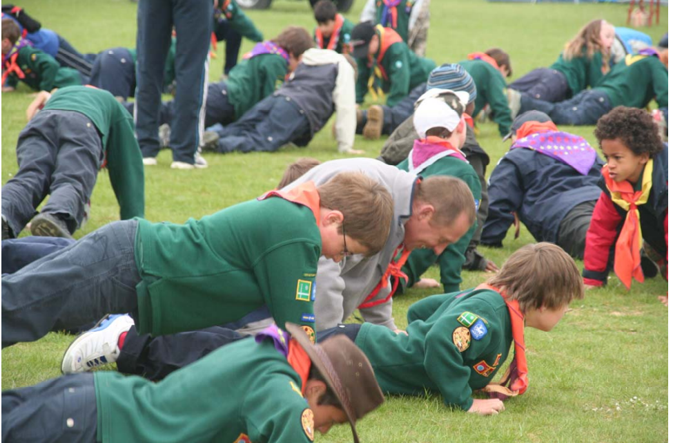
Cubs Scouts working up an appetite for breakfast