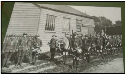
1919 - 1st Baldock Scouts Bugle Band