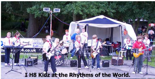
I H8 Kidz at the Rhythms of the World.