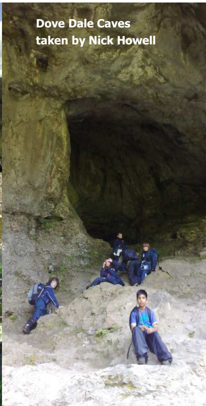
Dove Dale Caves