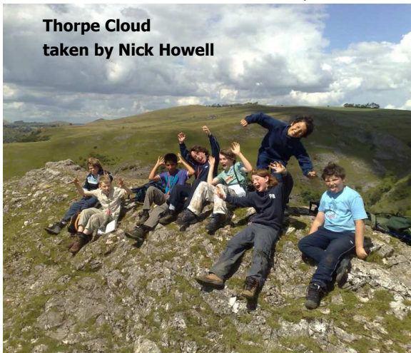
Thorpe Cloud