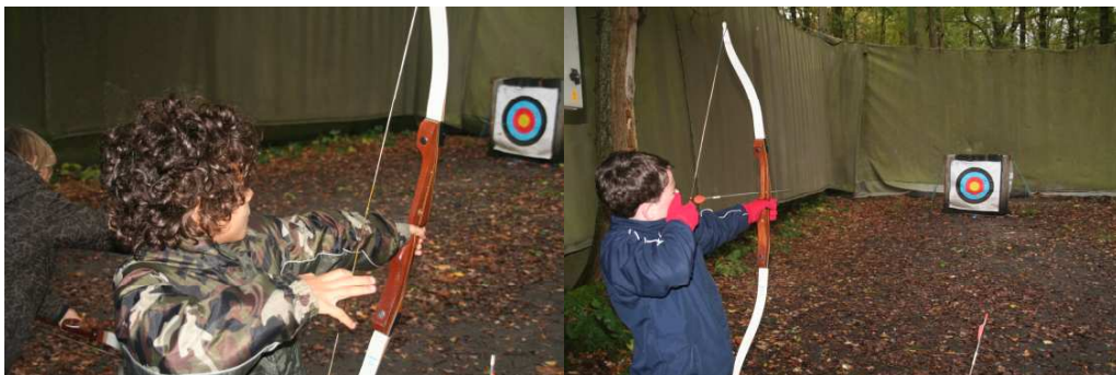
Friends together at Tolmers - 11th Letchworth Cubs enjoying an activity day