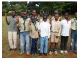
Junior Scouts (Chipukizi)