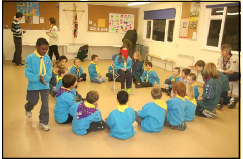
Now - November 2007

11th Letchworth Scout Group officially opened their refurbished Headquarters in Rushby Mead 26 November 2007. Ex-members of the Group as well as representatives from organisations who gave grants towards the cost attended the evening. All were impressed by the modernised HQ. The Group has already benefited by an increase in the number of young people attending. The Group is actively participating with the local Schools to increase the number of eight years olds and recruitment of Leaders and helpers. Congratulations to all who helped and contributed to the headquarters.