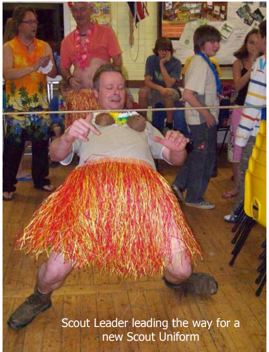
Scout Leader leading the way for a new Scout Uniform

The evening passed extremely quickly, good fun had by all and a fantastic £130.00 raised for BBC Children in Need.