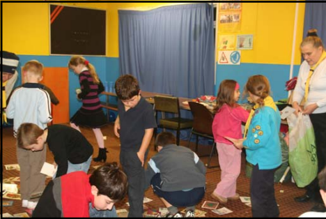
Then - December 2006