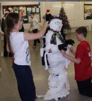
8th Letchworth Scouts' Christmas party including the best dressed snowman competition.