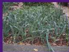
So do vegetables!