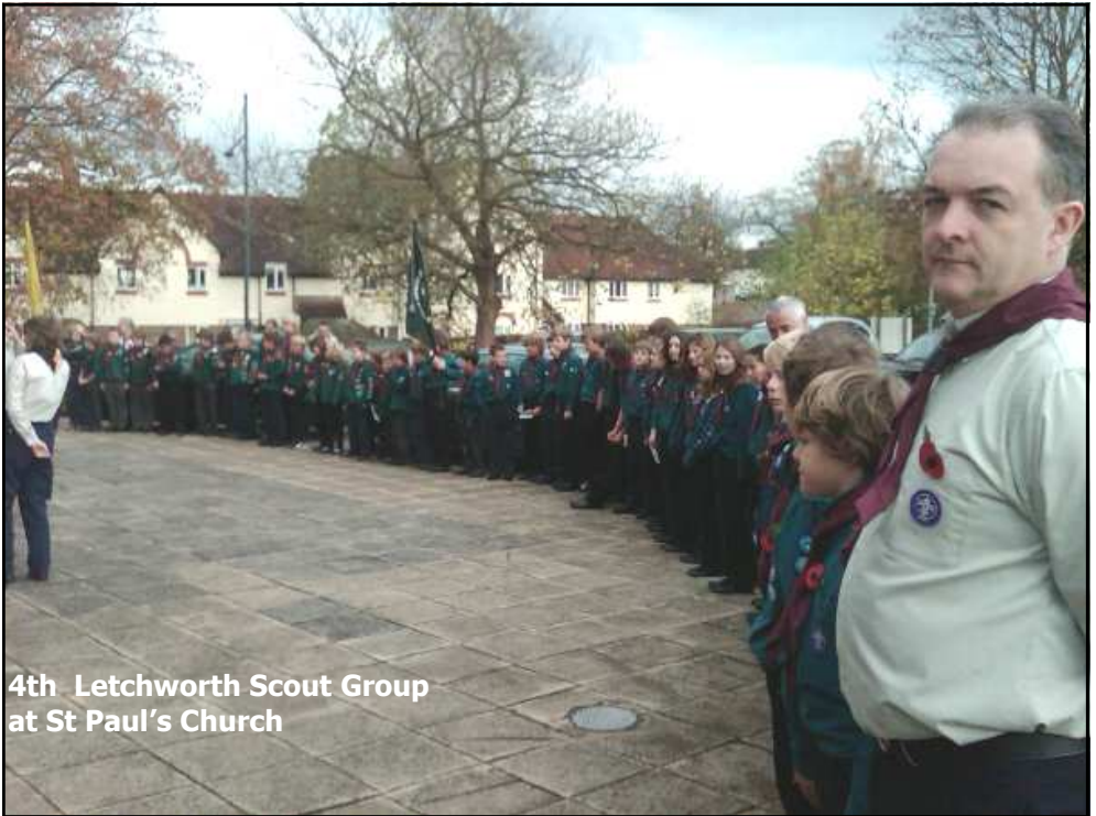
4th Letchworth Scout Group at St Paul's Church