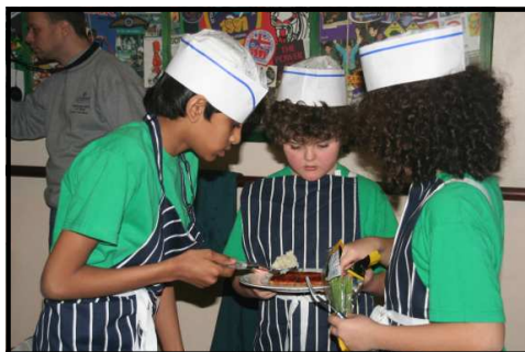
18th Bushey & Oxhey

The winners of the competition for the third year running were 2nd Ware ( 215) and 2nd place went to 6th Welwyn Garden City (204) closely followed by 1st Ashwell (191).