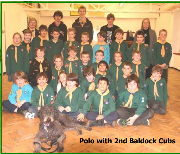
Polo with 2nd Baldock Cubs