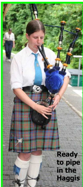
Ready to pipe in the Haggis