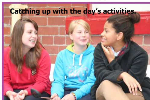
Catching up with the day's activities.