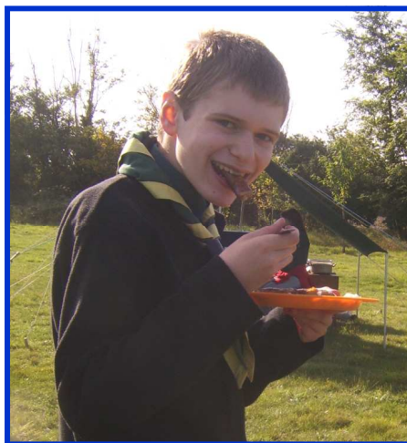
1st Baldock Scout MMC2