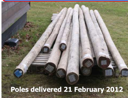
Poles delivered 21 February 2012