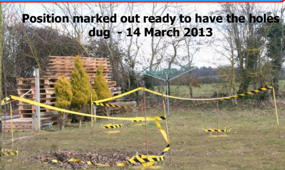
Position marked out ready to have the holes dug - 14 March 2013