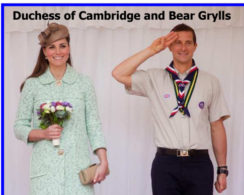
Duchess of Cambridge and Bear Grylls

After the service we re-grouped and our section leader gave us 2 small plastic stained glass windows, one for us and one to pass on to someone who we think should do their Queen's Scout Award. We then paraded through the castle and back to the Royal Mews. The route was lined with masses of people all there to watch us. This was unexpected as we thought it would be just family and friends. This was one of the best moments seeing everyone so proud of us.