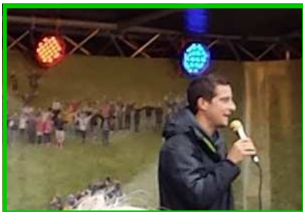
Bear Grylls, Chief Scout at the GR8 BIG B@SH