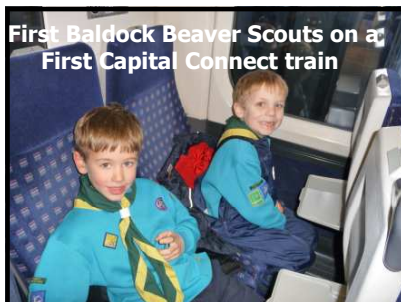
First Baldock Beaver Scouts on a First Capital Connect train

Printed by: Print Factory, Whitehorse Street, Baldock, Printfactory@tesco.net