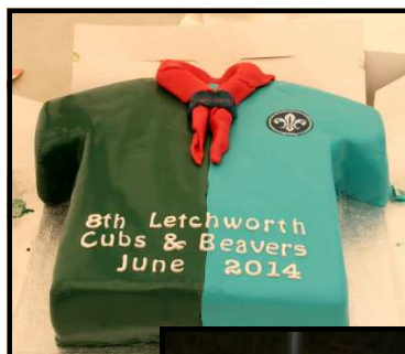
Cake made by an 8th Letchworth Parent