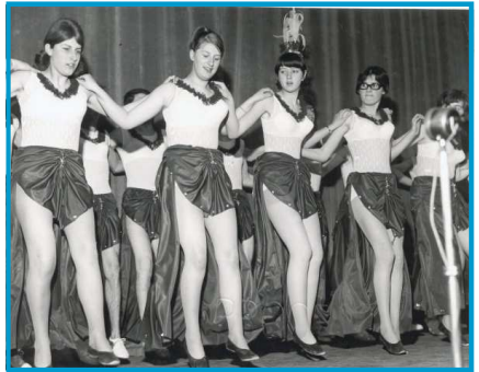
Photos from the 1975 show - 40 years ago

The 2015 show is well under way and as it is their 50th show they want to make it really special.