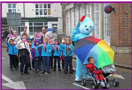
4th Letchworth Beavers taking part in the Letchworth Festival Parade Saturday 13 June 2015.