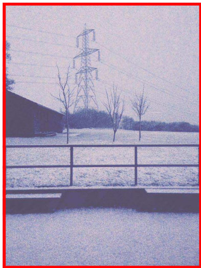
Photo taken at the 8th Letchworth Beaver sleepover at Wymondley Wood on Saturday 21 November 2015 at 7.00 am. First snow of the winter season.