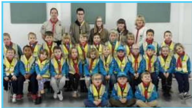
8th Letchworth Beavers in their lovely new Hi-Viz from Spec Savers

Nothing better on a December morning than getting outdoors. The 8th Letchworth Scout spent the day helping Friends of Norton Common clear scrub and taking out small trees to help with woodland regeneration.