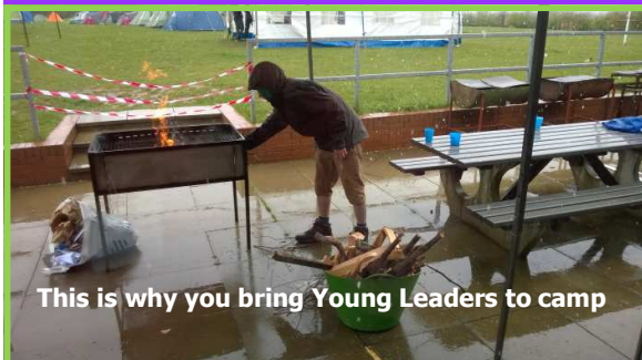
This is why you bring Young Leaders to camp

I really enjoyed the shooting the axes and saws were fun too. Shame about the weather.