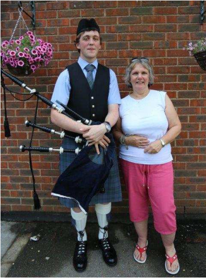
Image given the task to organise a Scottish breakfast for a retiring member of staff at a school. (Woolenwich Infant School, Stevenage)

You make a list of things that you would like - all ingredients of a Scottish breakfast, music, bagpipes etc. You talk to the schools cook about the food. You arrange for the children to sing a few Scottish songs and do some highland dancing.