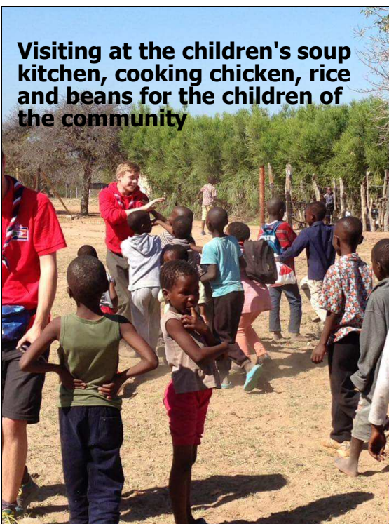
Visiting at the children's soup kitchen, cooking chicken, rice and beans for the children of the community