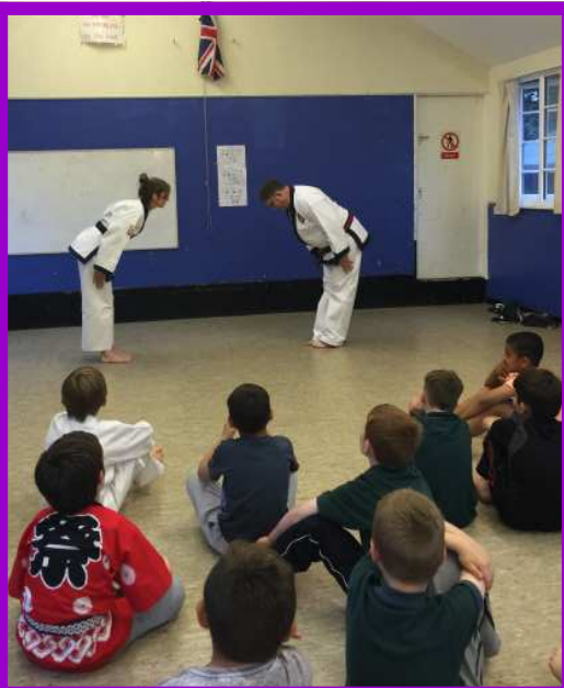
5th Letchworth Cubs See page 2 for article

Printed by: Print Factory, 32 Whitehorse Street Baldock SG7 6QQ Printfactory@tesco.net 01462 896289