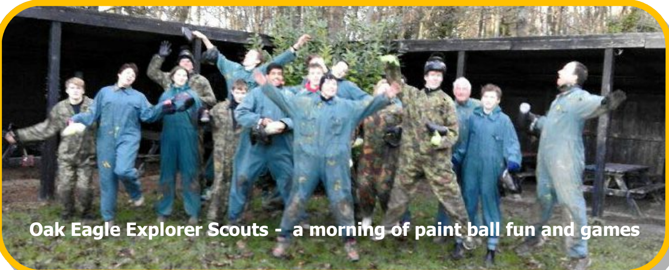
Oak Eagle Explorer Scouts - a morning of paint ball fun and games