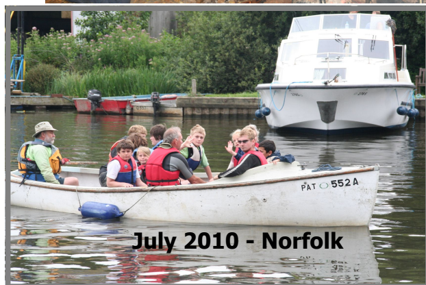
July 2010 - Norfolk