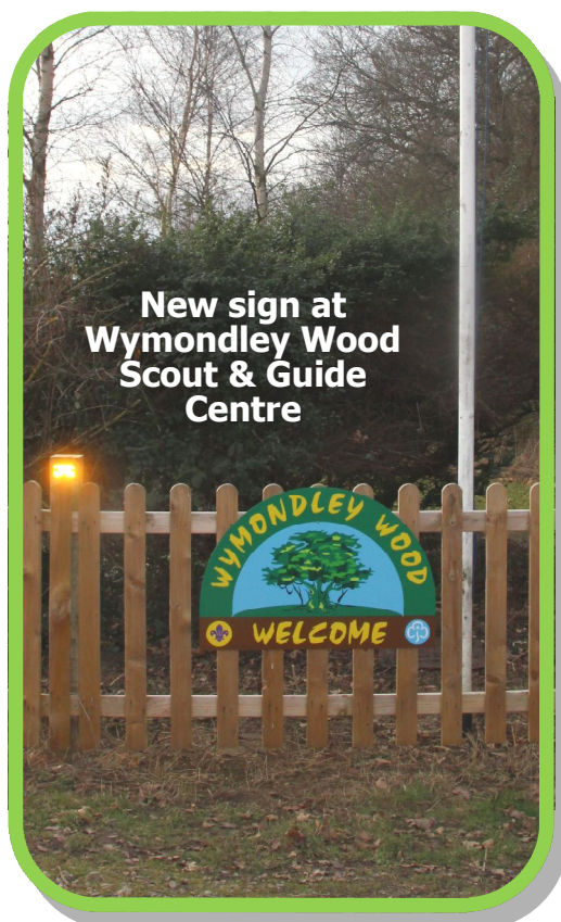
New sign at Wymondley Wood Scout & Guide Centre

Printed by: Print Factory, 32 Whitehorse Street Baldock SG7 6QQ Printfactory@tesco.net 01462 896289