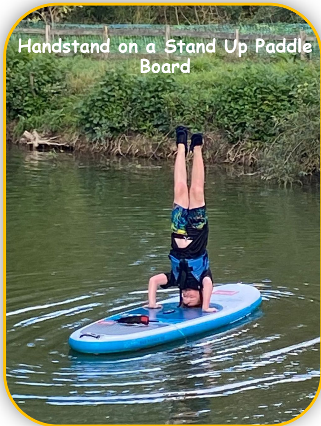
Handstand on a Stand Up Paddle Board