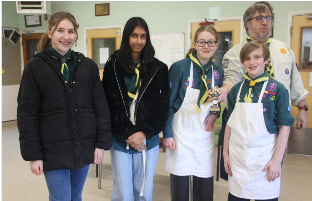
Winners 1st Baldock

Many thanks to the parents of both Groups. They can be proud of their young cooks and what they have achieved.