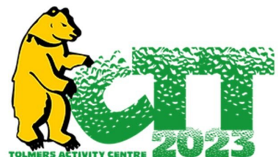
Circus Skills Night

Editor: Rita Hawkins 1 South Close, Baldock , Hertfordshire SG7 6DS