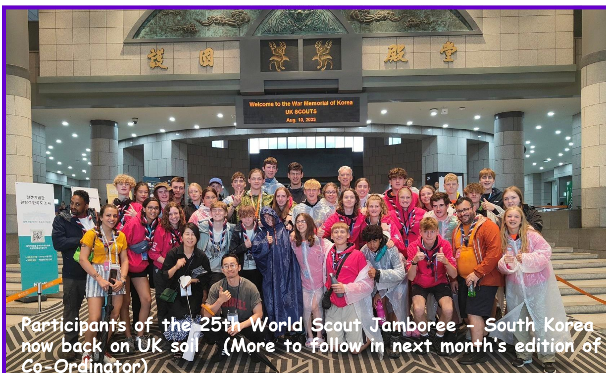
Participants of the 25 th World Scout Jamboree - South Korea now back on UK soil (More to follow in next month's edition of Co-Ordinator)