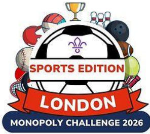
Oak Eagle Explorer Scouts