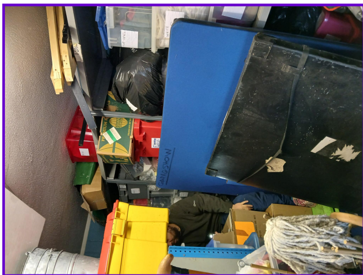
Start of clear out