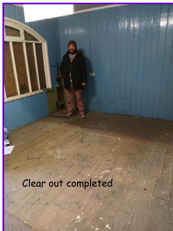
Clear out completed